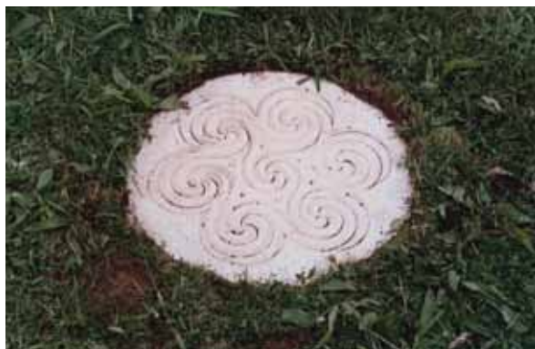
The stone at the centre of the Labyrinth.